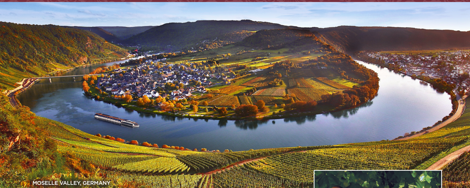
MOSELLE VALLEY, GERMANY

Uncork local traditions, savor intense flavors and enjoy palate-pleasing adventures during an AmaWaterways Wine Cruise